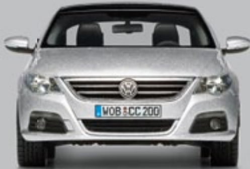
Passat CC Always among the frontrunners in every good Volkswagen model collection: the Passat CC. The perfect balance of sportiness, elegance and innovation. Model year: 2008 · Scale: 1:43 · Manufacturer: Schuco 3C8.099.300. .A7W Reflex Silver Metallic 3C8.099.300. .041 Black