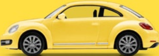
Beetle Striking, sporty, self-confident. And already a classic. Once you have got your hands on a Beetle model car, you will never want to let it go. Model year: 2011 · Scale: 1:87 · Manufacturer: Wiking 5C1.099.301. .PXP Sunflower 5C1.099.301. .B5K Platinum Grey Metallic 5C1.099.301. .Y3D Tornado Red