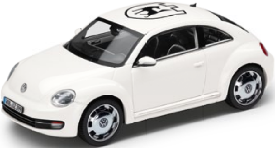
Beetle “Coat of Arms” Decorative Film Unmistakeably Beetle, unmistakably Volkswagen. The Wolfsburg coat of arms on the miniature model reflects a love for the Beetle's birthplace. Model year: 2011 · Scale: 1:43 · Manufacturer: Schuco 5C1.099.300.C .B9A Candy White with a “Coat of Arms” decorative film