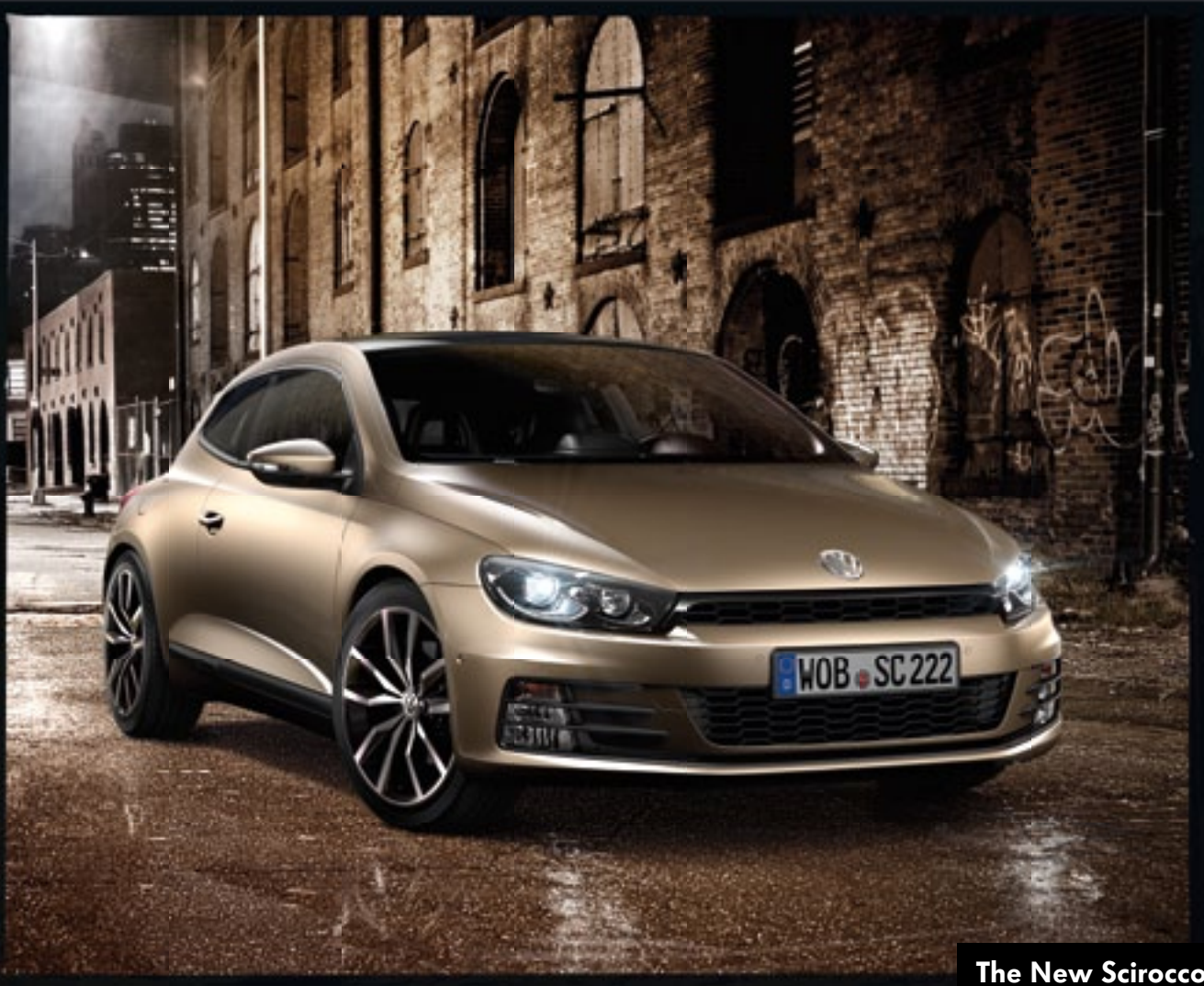
The 1:43 model version of the Scirocco will be available from January 2015. Illustration similar.

The New Scirocco. This sporty classic is now faster and more dynamic than ever before. The radiator grille and unmistakable honeycomb design highlight the design's sharp, striking lines.