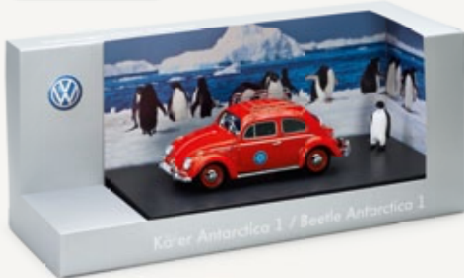
Classic · 1:43

The “Antarctica 1” Beetle An exciting look back at automotive history: To pay homage to the intricate design of models of classic Volkswagen cars like the Antarctic expedition car, they are presented in a high-quality silver box. The back cover features a unique design as well as information on the vehicle in both German and English.