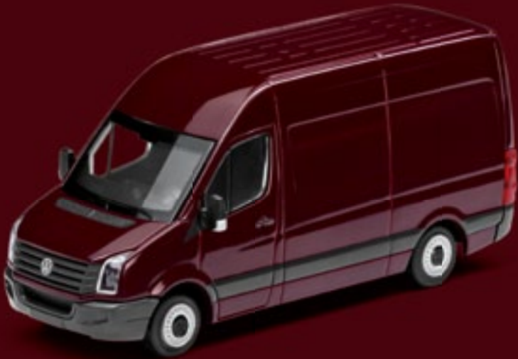
Crafter Extreme jobs require reliable partners. The Crafter is the largest vehicle in the Volkswagen product range and also a great partner. The precision model depicts the van with a high roof and medium wheelbase. Model year: 2011 · Scale: 1:87 · Manufacturer: Rietze 2E1.099.301. .4CC Spanish Red 2E1.099.301. .B9A Candy White