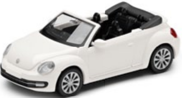
Beetle Cabriolet For many model car enthusiasts, cabriolets are the highlights of their collections because open-top models give them the chance to take a closer look at the interior. The Beetle Cabriolet turns open-top driving into a way of life. Model year: 2012 · Scale: 1:87 · Manufacturer: Wiking 5C3.099.301. .54H Deep Black Pearl Effect 5C3.099.301. .P5F Denim Blue 5C3.099.301. .P7W Moon Rock Silver Metallic 5C3.099.301. .B9A Candy White