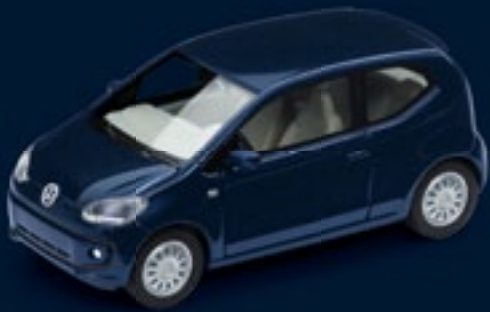
up! The up! is an urbanite through and through. A compact 2-door car that shows that good things can come in small packages, featuring innovative, intuitive functions. The perfect addition to a comprehensive model car fleet. Model year: 2011 · Scale: 1:87 · Manufacturer: Herpa 1S3.099.301. .H5X Dark Blue Metallic 1S3.099.301. .C9X Black Pearl