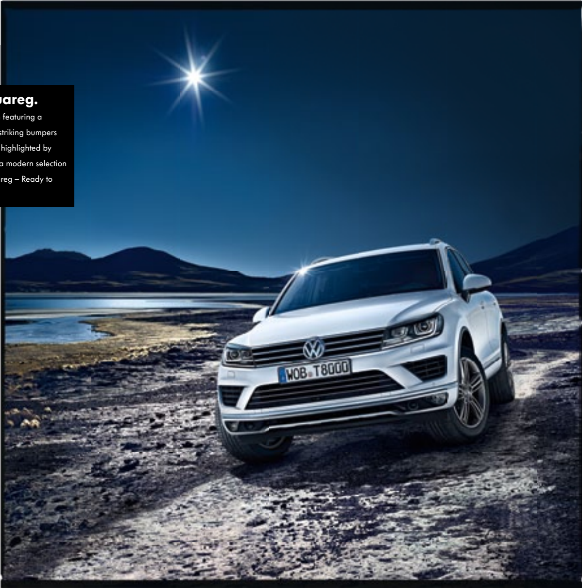
The 1:87 scale model version of the Touareg will be available from March 2015. Illustration similar.

The New Touareg. Ground-breaking design featuring a compact radiator grille, striking bumpers and a powerful tailgate, highlighted by sporty alloy wheels and a modern selection of colours: The new Touareg – Ready to face new challenges.