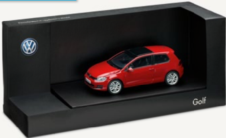
Series · 1:43 and 1:87

Golf Just like the latest 2-door Golf, all of our miniatures are created using an intricate, high-quality production process. The precision and accuracy of the series is also reflected in the elegant black cardboard packaging which has been individually designed for every vehicle miniature.