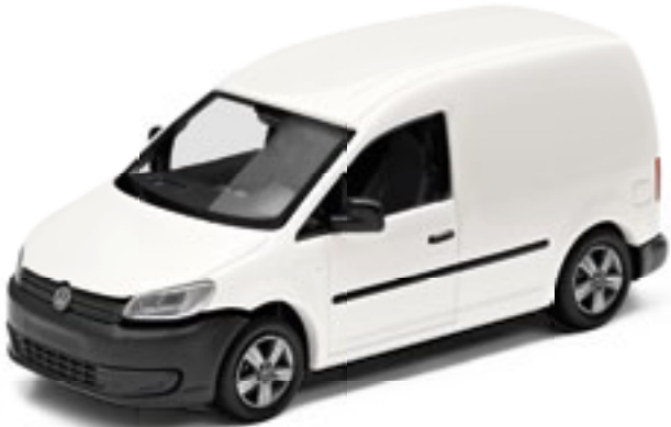
Caddy The professional worker. The panel van's interior sports an inspiring amount of cargo space, while the model's exterior impresses with its perfection. Model year: 2012 · Scale: 1:87 · Manufacturer: Rietze 2K1.099.301.A .WKF Candy White