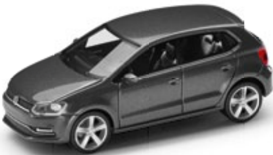
Polo Enjoy this true to life 1:87 miniature replica of the new Polo. The model version of the Polo also reflects its racy design. Model year: 2014 · Scale: 1:87 · Manufacturer: Herpa 6C1.099.301. .D7R Pepper Grey Metallic 6C1.099.301. .C9A Pure White 6C1.099.301. .A3X Sunset Red Metallic