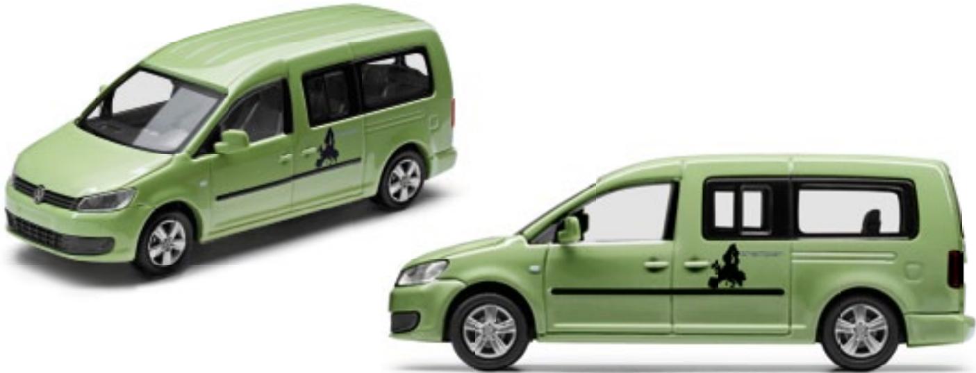
Caddy Maxi Tramper Always ready to camp out for the night: The Caddy Maxi Tramper transforms into a mobile camping site in a matter of moments. For everyone who thinks that on the road is the most beautiful place to be. An eye-catcher in any collection. Model year: 2012 · Scale: 1:87 · Manufacturer: Rietze 2K5.099.301. .J6E Primavera Green