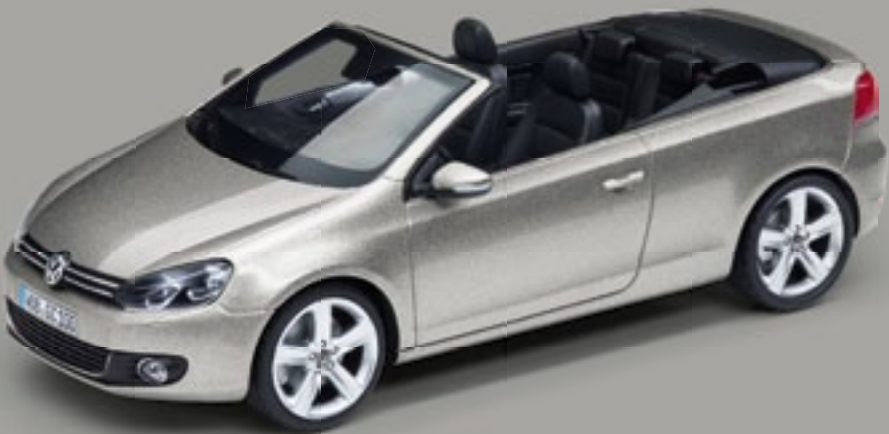
Golf Cabriolet The latest version of this cult classic as a 1:43 scale model car cuts a fine figure. Every finely crafted detail creates a desire for freedom and adventure. Model year: 2011 · Scale: 1:43 · Manufacturer: Schuco 5K7.099.300. .B7W Tungsten Silver Metallic 5K7.099.300. .ICO Deep Black Pearl Effect 5K7.099.300. .U4V Dark Purple Metallic 5K7.099.300. .OK1 Oryx White