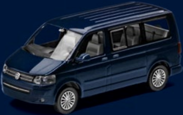
T5 Multivan The spacious saloon with outstanding comfort and enormous flexibility. Choosing the Multivan is easy. Much easier than deciding where you'll take it. The Volkswagen model car reflects this feeling perfectly. Model year: 2009 · Scale: 1:87 · Manufacturer: Wiking 7H5.099.301.GP.H5X Night Blue Metallic