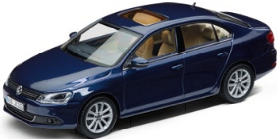
Jetta Thanks to its exceptional design and inspiring features, the full-size Jetta stands out from the crowd. The high-quality workmanship of the model car creates a sophisticated, true-to-scale replica. Model year: 2010 · Scale: 1:43 · Manufacturer: Minichamps 5C7.099.300. .P5W Tempest Blue Metallic 5C7.099.300. .6CY Black