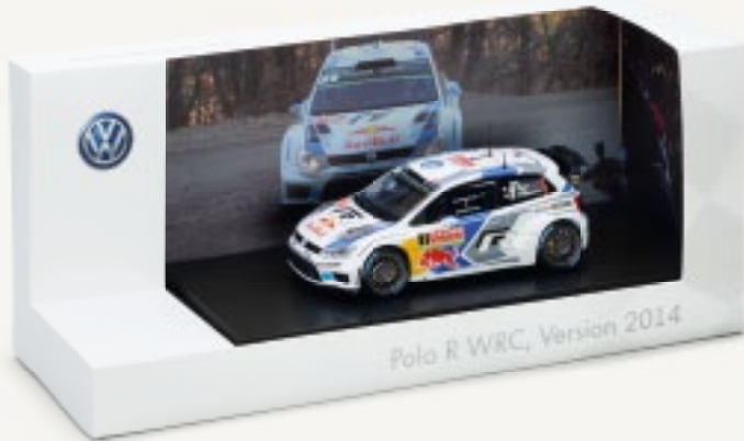
Motorsport · 1:43

Polo R WRC Brings a sportier look to every collector's cabinet. Motorsport models like the high-speed Polo R WRC are presented in a premium, Plexiglas white case, guaranteed to catch the eye. Each model's individual background and flag conjures up the atmosphere of the race.