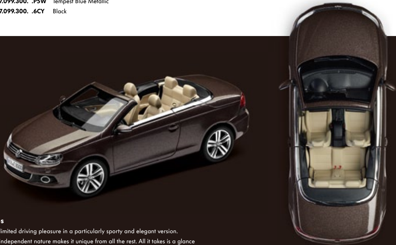
Eos Unlimited driving pleasure in a particularly sporty and elegant version. Its independent nature makes it unique from all the rest. All it takes is a glance at the carefully crafted model car to leave a lasting impression. Model year: 2011 · Scale: 1:43 · Manufacturer: Kyosho 1Q1.099.300. .B8R Black Oak Brown Metallic 1Q1.099.300. .A7W Reflex Silver Metallic 1Q1.099.300. .B9A Candy White