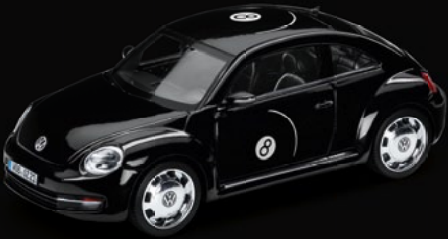
Beetle “Billiard Ball” Decorative Film The black billiard ball decoration on the roof and doors of the model car creates a stylish and powerful effect. Cult classic design at its finest. Model year: 2011 · Scale: 1:43 · Manufacturer: Schuco 5C1.099.300.B .041 Black with a “Billiard Ball” sticker