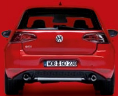
Golf GTI Three words to describe the Golf GTI: Sporty. Feisty. Striking. Are you ready for so much power in 2-door miniature form? Model year: 2013 · Scale: 1:43 · Manufacturer: Herpa 5G3.099.300.A .BFC Tornado Red 5G3.099.300.A .UJV Oryx White