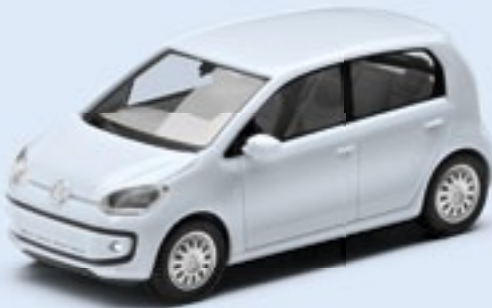
up! With the up!, the world is your oyster. The agile 4-door city car is a state-of-the-art interpretation of the world of Volkswagen design, even in 1:87 scale. Model year: 2012 · Scale: 1:87 · Manufacturer: Herpa 1S4.099.301. .OHN Light Blue 1S4.099.301. .Y3D Red 1S4.099.301. .A7W Light Silver Metallic 1S4.099.301. .B9A White