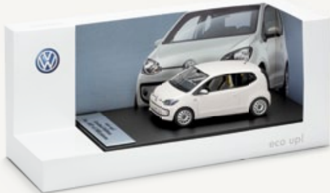
Study · 1:43

eco up! A glimpse of the car of the future: Innovative Volkswagen models like the eco up! are presented in high-quality white packaging with a Plexiglas window and also feature a close-up of the vehicle in the background. Visionary ideas in a compact little package.